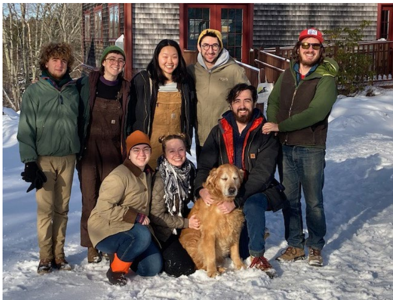
The Spring 2021 Apprentice Crew