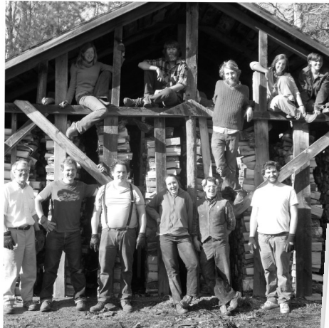
16 cords of firewood all split & stacked ready for next winter