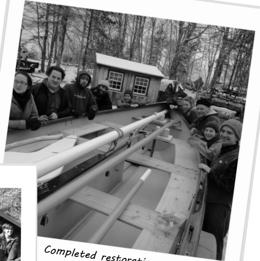
Completed restoration of a Whitehall for Camp Kieve